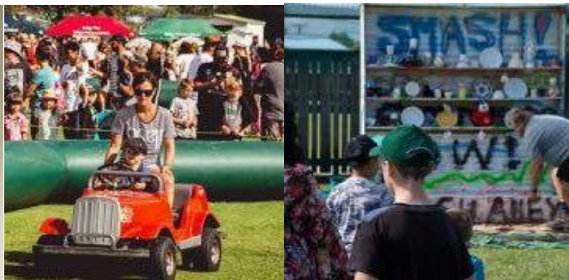
Lots of fun was had by the huge crowd that flocked to the Waipu Primary School Carnival over a beautifully fine Easter weekend. Above and below are a few pictures from the day. There are lots more pictures on the Carnival webpage. Money has been sent to the bank to be counted and once all expenses are to hand we will be able to tell you how much money was raised.