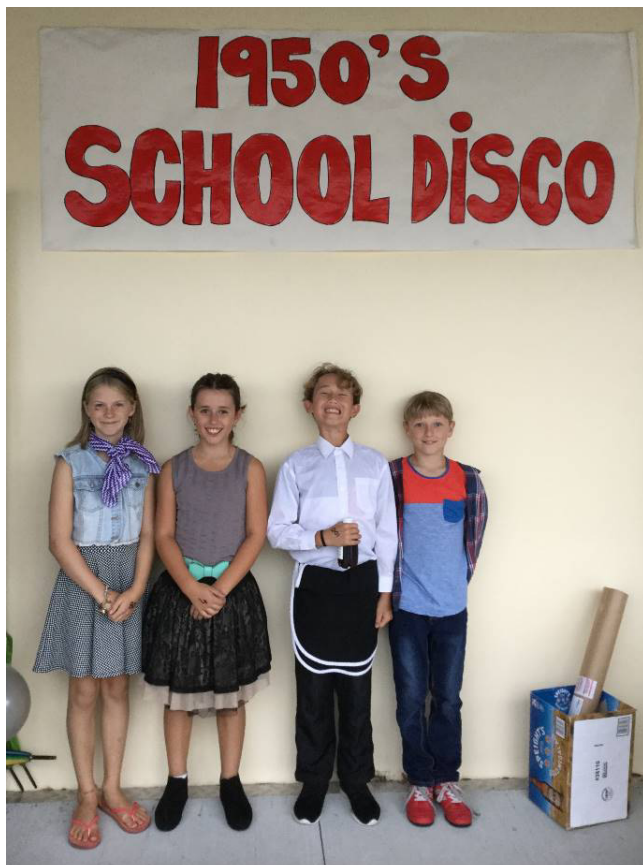
History was made when the first school disco was held in the Northpine Hall. Students came dressed from the 1950's era of rock'n'roll.